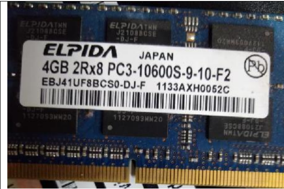
Sony laptop RAM